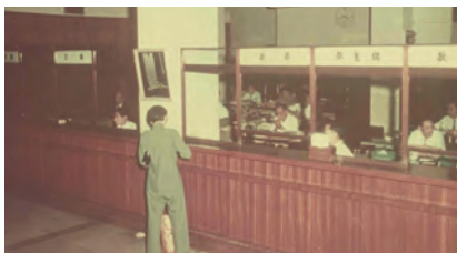
昔日廣東銀行櫃位 Service counters of Bank of Canton in the past

The Bank expanded its business to Macau by setting up a subsidiary called Bank of Canton (Macau), which was the first Chinese-owned financial institution registered in Macau.