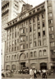
昔日位於德輔道中6號的廣東銀行總行 The Bank of Canton's head office was located at 6 Des Voeux Road Central