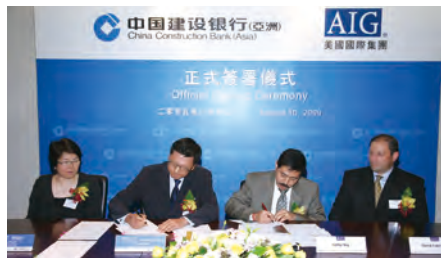
建行(亞洲)收購美國國際信貸(香港)簽約儀式 Signing ceremony of the acquisition of AIG Finance (Hong Kong)

CCB (Asia) acquired AIG Finance (Hong Kong) and was renamed China Construction Bank (Asia) Finance, laying the solid foundation for expanding the credit card and personal loan businesses in Hong Kong.