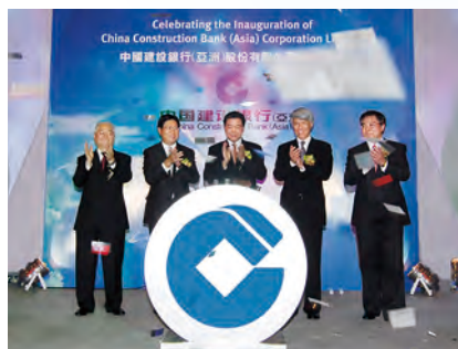
建行(亞洲)啟名慶典(2007年) The inauguration of CCB (Asia) (2007)

中國建設銀行(「建設銀行」)向美國銀行收購美國銀行(亞洲)的全部股份，並將其更名為中國建設銀行(亞洲)(「建行(亞洲)」)。