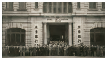
慶祝廣東銀行成立35週年(1947年) Celebration of the 35th Anniversary of The Bank of Canton (1947)

World War II ended and Hong Kong was liberated. Former staff rebuilt The Bank of Canton and its banking business was quickly back on track. It soon became the largest Chinese-owned remittance and foreign exchange bank in Hong Kong in the post-war era.