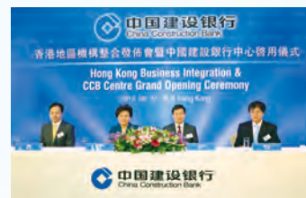
建行香港地區機構整合發佈會 CCB Hong Kong Business Integration Ceremony

The three buildings of CCB in Hong Kong were officially inaugurated. CCB Tower in Central is the head office of CCB (Asia). CCB Centre in Kowloon Bay is the mid-to-back office of CCB's entities in Hong Kong. Located in Sai Wan, CCB Hong Kong Training Centre is CCB's first offshore training centre.