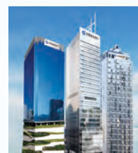
(由左至右)中國建設銀行中心、中國建設銀行大廈、中國建設銀行香港培訓中心 (From left to right) CCB Centre, CCB Tower, CCB Hong Kong Training Centre