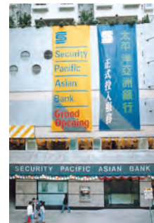
太平洋亞洲銀行正式投入服務 The inauguration of Security Pacific Asian Bank

The Bank of Canton officially announced its cooperation with Security Pacific National Bank in 1971. In 1988, The Bank of Canton was officially renamed Security Pacific Asian Bank.